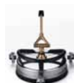
FR 30 Me Hard surface cleaner 2.640-355