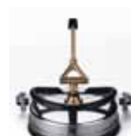
FR 30 Me Hard Surface Cleaner 2.640-355