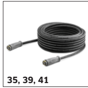
35, 39, 41