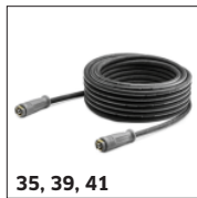
35, 39, 41